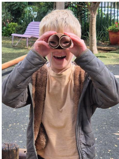
Looking for wild animals