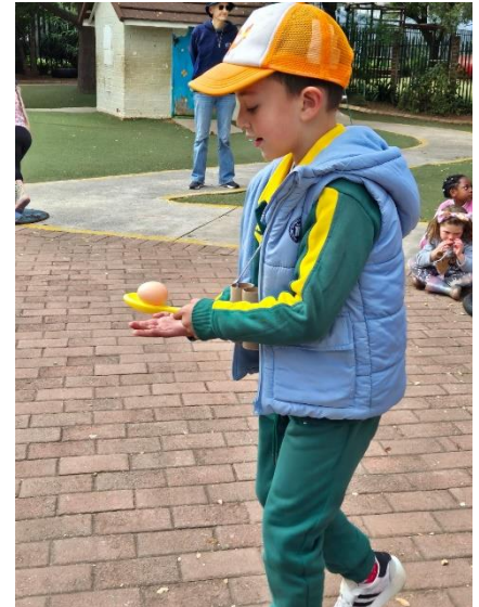
Egg and spoon races